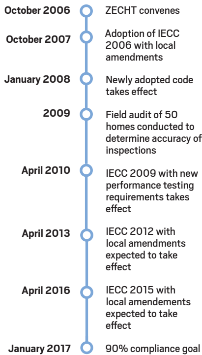
Figure 2: This sequence of events depicts the code adoption process in Austin, beginning with the creation of a Zero Energy Capable Homes Task Force (ZECHT) in 2006. The plan developed by ZECHT called for periodic code updates between 2007 and 2015, which would result in homes energy efficient enough to achieve net-zero energy consumption over the course of a year, and with the addition of on-site renewable energy generation. Performance testing requirements—including blower door, duct leakage, air flow, and system static testing—came into effect in 2010 to ensure that homes were in compliance with codes.

the commercial code is expected to have performance requirements with the adoption of the IECC 2015. 5